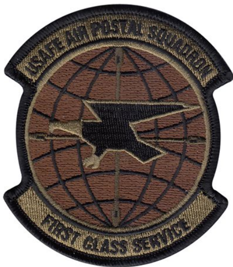
United States Air Forces in Europe Air Postal Squadron

2 Air Postal Squadron emblem: On a disc as a globe Azure, gridlined Sable, four contrails per cross terminating in stylized flight symbols Or, overall a U.S. Postal Eagle of the second, edged and garnished Argent; all within a border parted per border White and Black. Attached above the disc, a White scroll edged with a narrow Black border and inscribed "FIRST CLASS SERVICE" in Black letters. Attached below the disc, a White scroll edged with a narrow Black border and inscribed "2D AIR POSTAL SQ" in Black letters. Ultramarine blue and Air Force yellow are the Air Force colors. Blue alludes to the sky, the primary theater of Air Force operations. Yellow refers to the sun and the excellence required of Air Force personnel. The United States Postal Eagle symbolizes the military postal service overseas. The globe is representative of the expeditious service provided worldwide. The aerospace symbols aligned to the compass signify the scope of