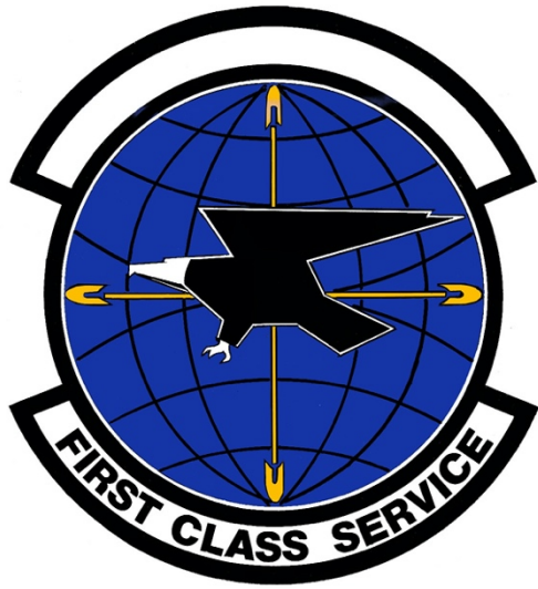
2 Air Postal Squadron emblem